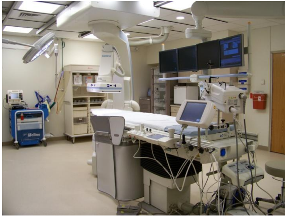
State of the art equipment inside the W.S. & E.C. Jones Cardiovascular Lab

The financial support from the W.S. & E.C. Jones Testamentary Trust has truly made a difference in the lives of many individuals and families. Bringing this service to Newman Regional Health would have been much more difficult without the generosity of the W.S. & E.C. Jones Testamentary Trust.