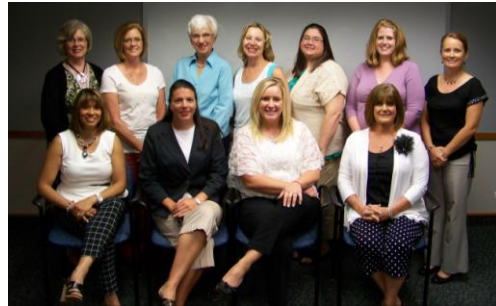
Denim & Diamonds Planning Committee